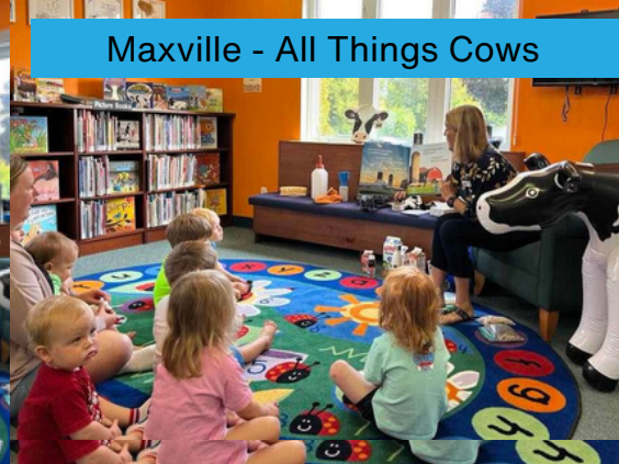
Maxville - All Things Cows