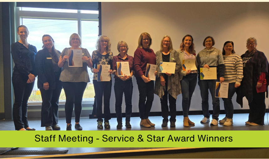
Staff Meeting - Service & Star Award Winners