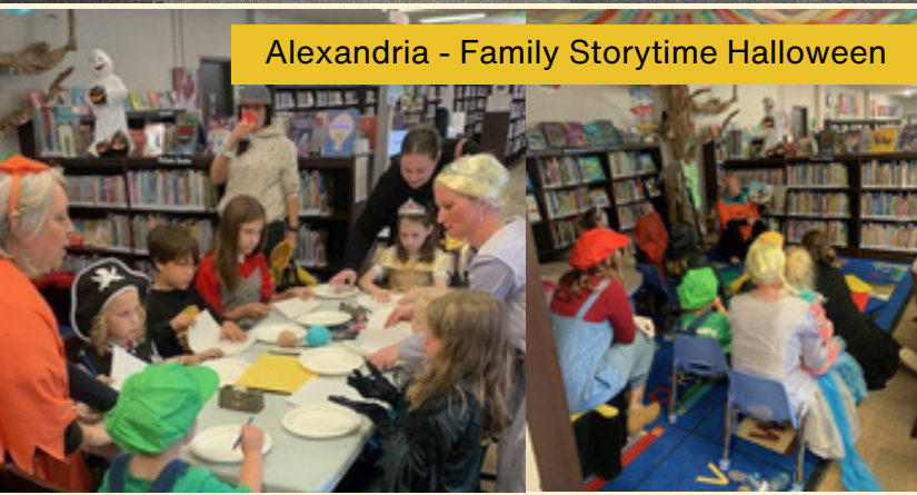
Alexandria - Family Storytime Halloween