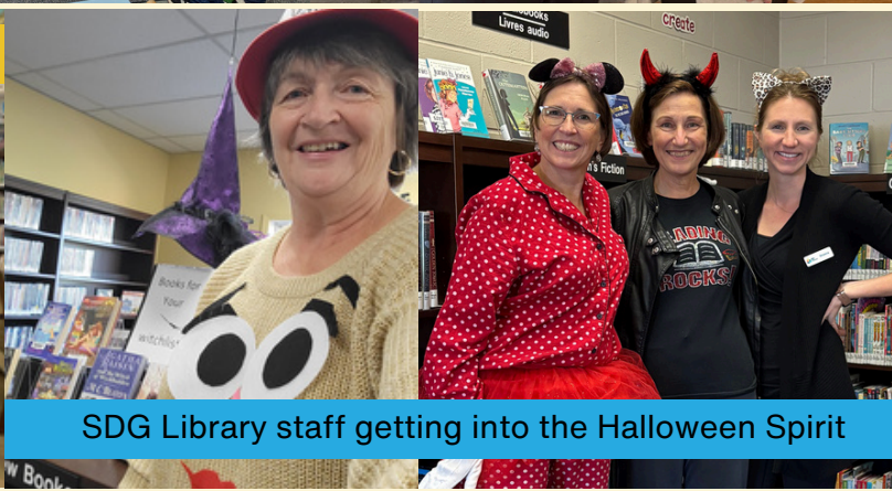
SDG Library staff getting into the Halloween Spirit