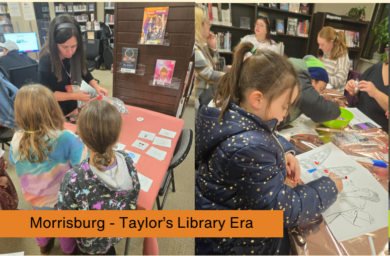
Morrisburg - Taylor's Library Era