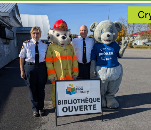
Crysler - Storytime with Sparky