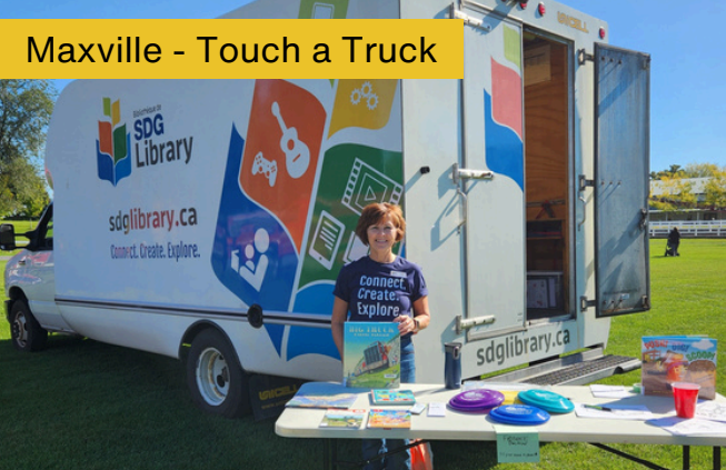
Maxville - Touch a Truck